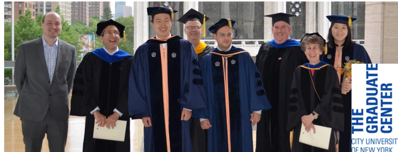
CUNY Ph.D. Commencement

American Chemical Society Committee on Science New York Local Section Chair ACS Fellow