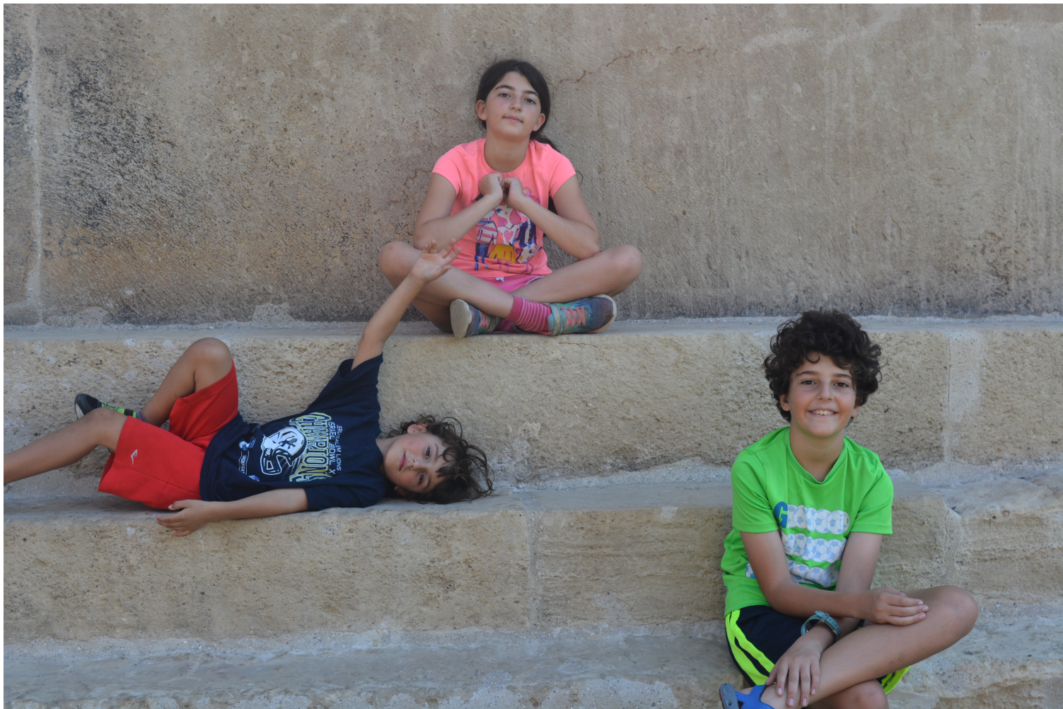
These little bandits make me busy.